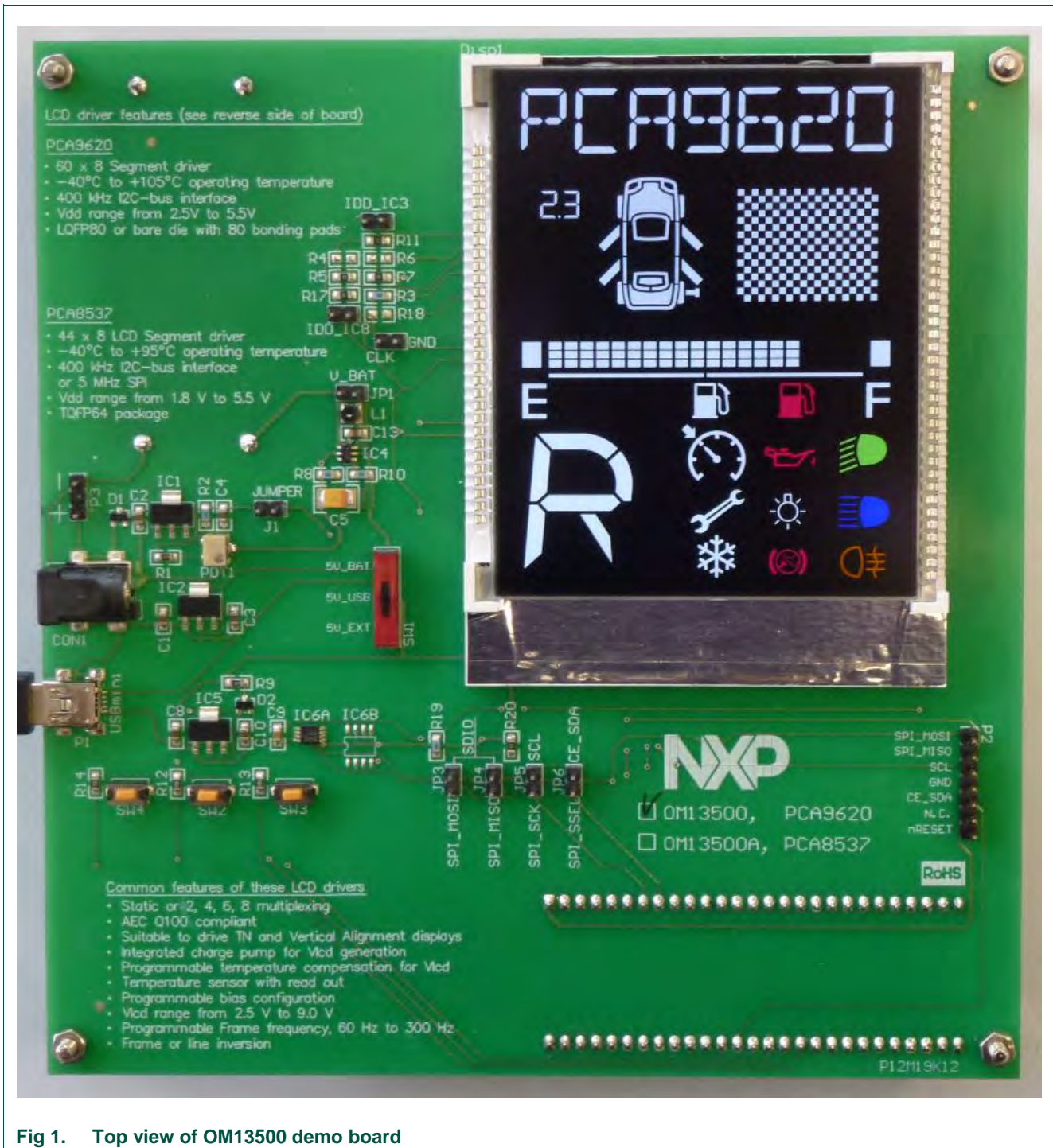
Fig 1. Top view of OM13500 demo board

For best optical performance, remove the protective foil from the display.