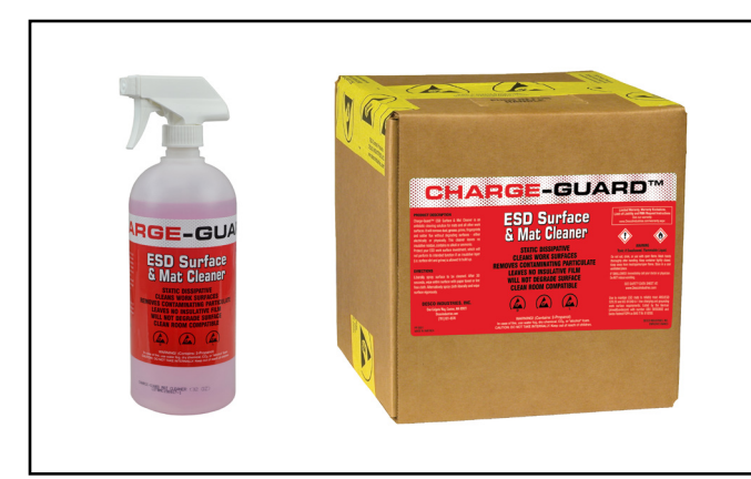
Figure 1. Charge-Guard® Surface & Mat Cleaner: 8002 1 quart (1 litre) spray bottle 8003 2.5 Gallon (10 litre) Bag-in-Box