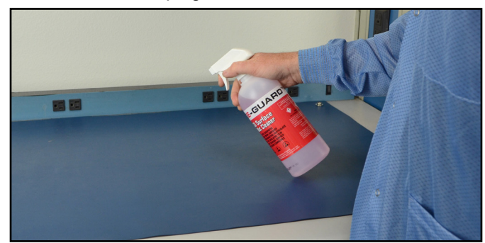
Figure 2. Applying Charge-Guard® to the mat.

Apply Charge-Guard<sup>®</sup> Surface & Mat Cleaner to the entire surface to be treated using either the pump or trigger spray bottle. Use a lint-free cloth to wipe the surface until dry. For set stains, let Charge-Guard<sup>®</sup> Surface & Mat Cleaner soak on the surface for 30 seconds before wiping clean.